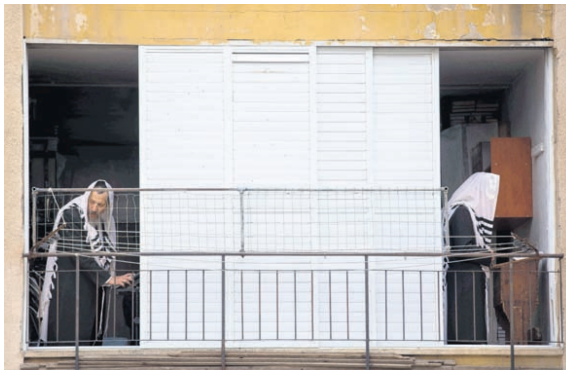
Ultra-Orthodox Jews pray a morning prayer at their house as synagogues are closed following the government's measures to help stop the spread of the coronavirus, in Bnei Brak, Israel, Tuesday, April 14, 2020.

But the increasing use of such technology against civilians has raised privacy concerns and difficult questions about how far authorities can or should